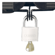
Brackets and wing lock for locking the side wings in front of the display