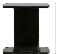
Extender for height adjustable aluminum columns in different versions