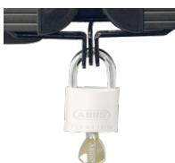
Brackets and wing lock for locking the side wings in front of the display