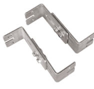
2 galvanized adjustable wall mounting brackets