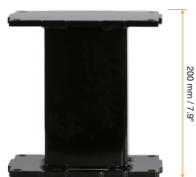
Extender for height adjustable aluminum columns in different versions