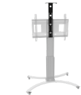
Video conference camera top shelf LITE series for displays from 65 - 86 inch