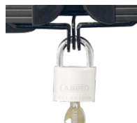
Brackets and wing lock for locking the side wings in front of the display