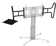
Two large and sturdy handles including laptop shelf