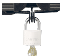
Brackets and wing lock for locking the side wings in front of the display