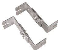
2 galvanized adjustable wall mounting brackets