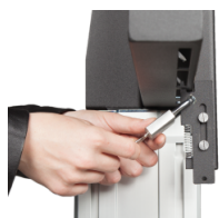
Safety padlock 4 pieces