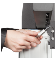
Safety padlock 1 piece