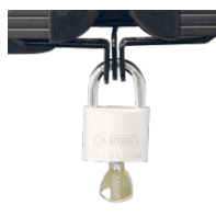
Brackets and wing lock for locking the side wings in front of the display