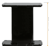
Extender for height adjustable aluminum columns in different versions