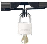
Brackets and wing lock for locking the side wings in front of the display