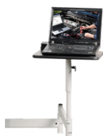
Swivel arm for notebooks