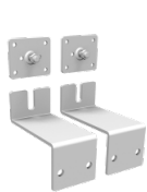
2 galvanized wall mounting brackets