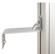
Lockable wall brackets