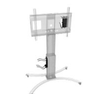
Universal PC bracket