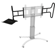
Two large and sturdy handles including laptop shelf