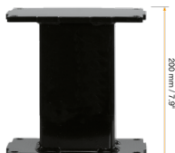
Extender for height adjustable aluminum columns in different versions