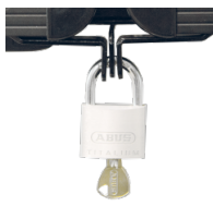
Brackets and wing lock for locking the side wings in front of the display