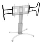
Two large and sturdy handles