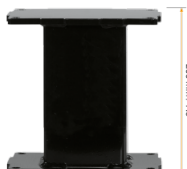
Extender for height adjustable aluminum columns in different versions