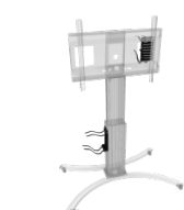
Universal PC bracket