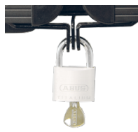
Brackets and wing lock for locking the side wings in front of the display