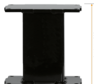
Extender for height adjustable aluminum columns in different versions